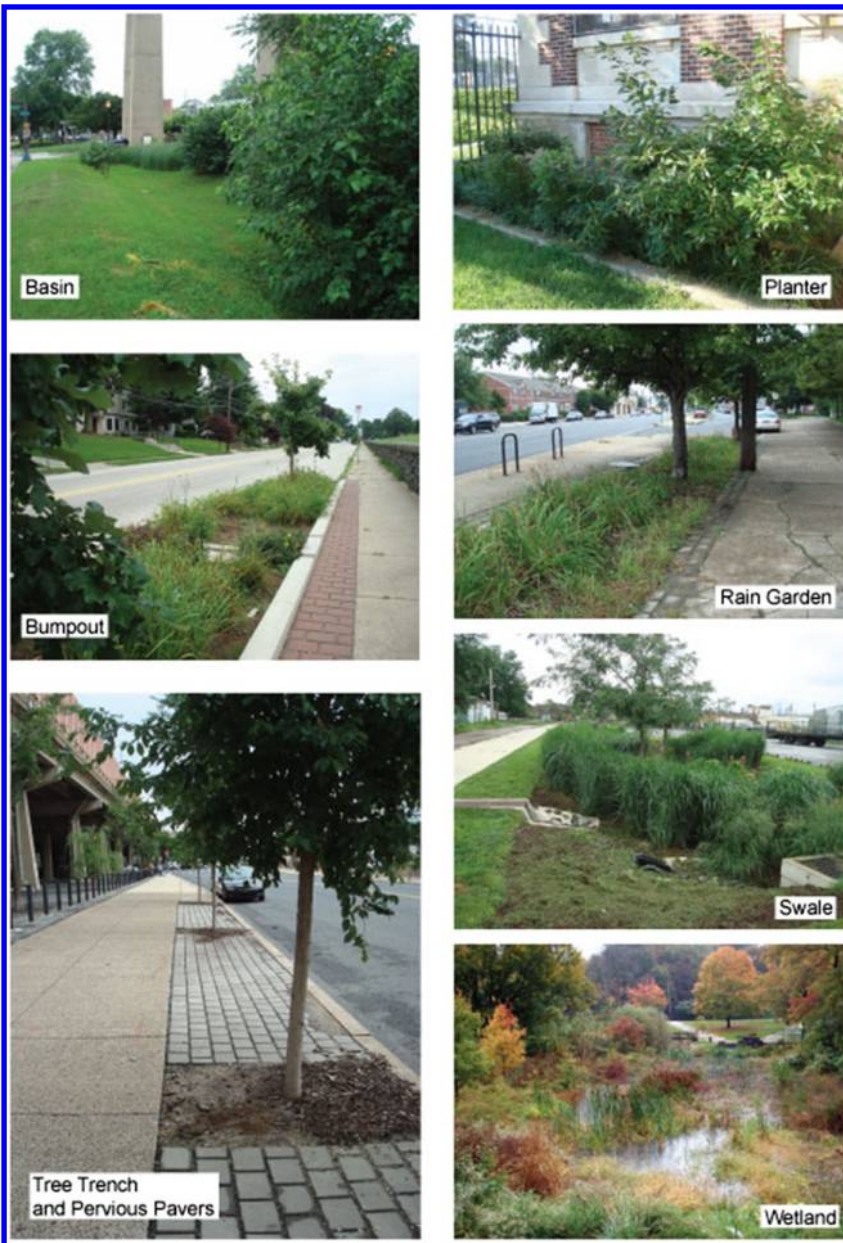
Note. Infiltration and storage trenches (not pictured) are belowground and are often colocated with other features.